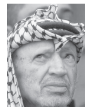
Yasser Arafat Palestinian political leader