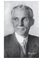
Henry Ford American entrepreneur