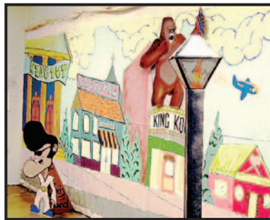
Submitted by Sue Mulcahy Art students created the set for a play.

the skills to do this. They were a little overwhelmed, and someone suggested