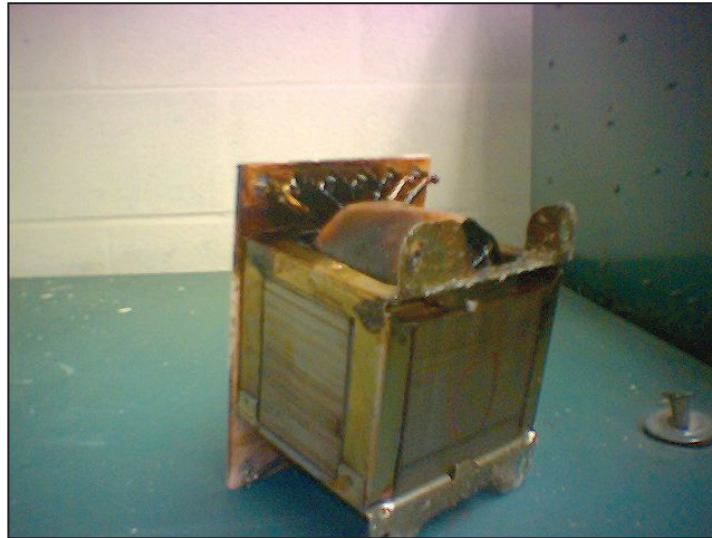
A transformer blew in the Wood Campus center last Monday causing an emergency evacuation of the entire building.