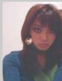
.hester hugs trees.

A MySpace whore is someone who tries to get as many people on their friends list as they can.